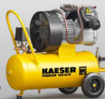
Image: PREMIUM 450/40 W