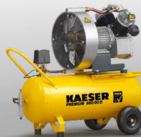
Image: PREMIUM 660/90 D