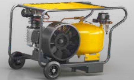
Image: PREMIUM CAR 350/30 W