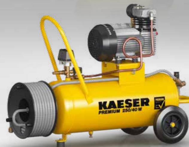
Image: PREMIUM 250/40 W