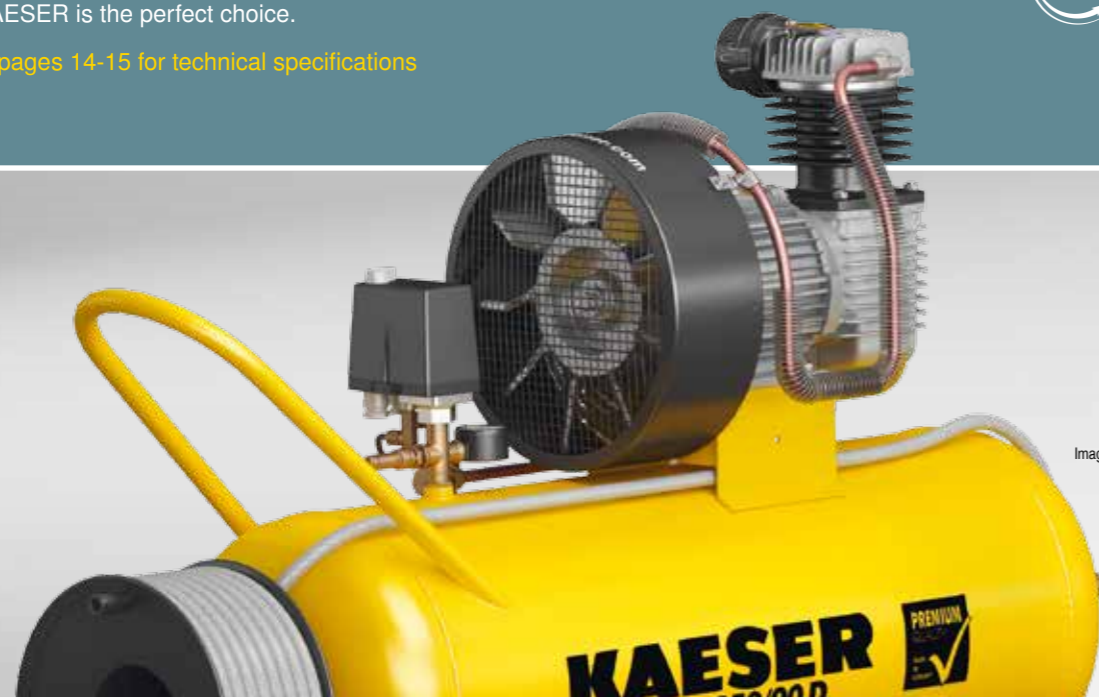
Image: PREMIUM 350/90 D