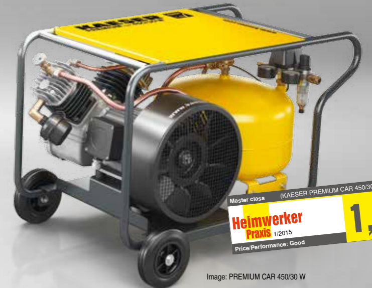
Image: PREMIUM CAR 450/30 W

Master class (KAESER PREMIUM CAR 450/30 W) Heimwerker Praxis 1/2015 Price/Performance: Good 1,3