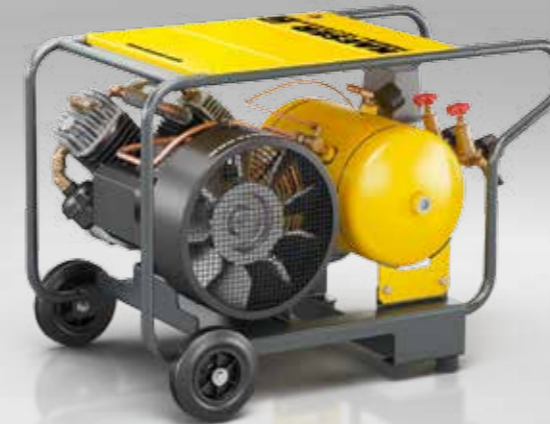
Image: PREMIUM CAR 150-2/16 W