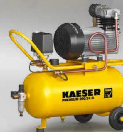
Image: PREMIUM 200/24 D