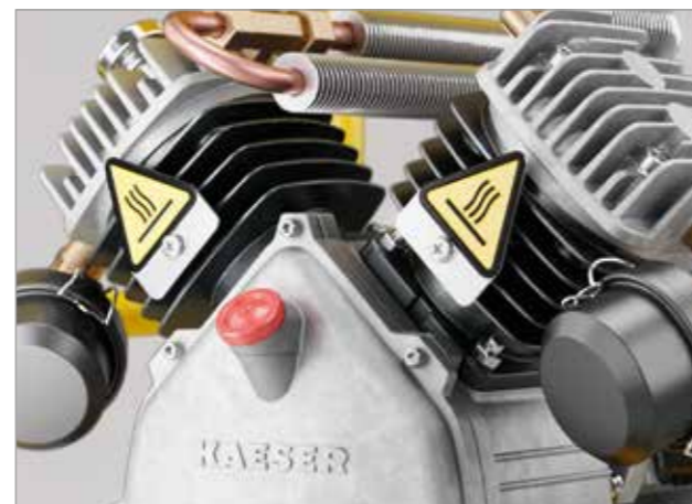
Image: KAESER-quality compressor block

The key compressor components are highlighted below: