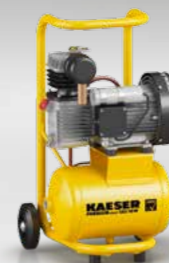
Image: PREMIUM SILENT 130/10W