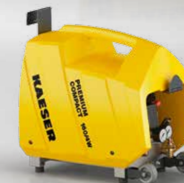
Image: PREMIUM COMPACT 160/4W