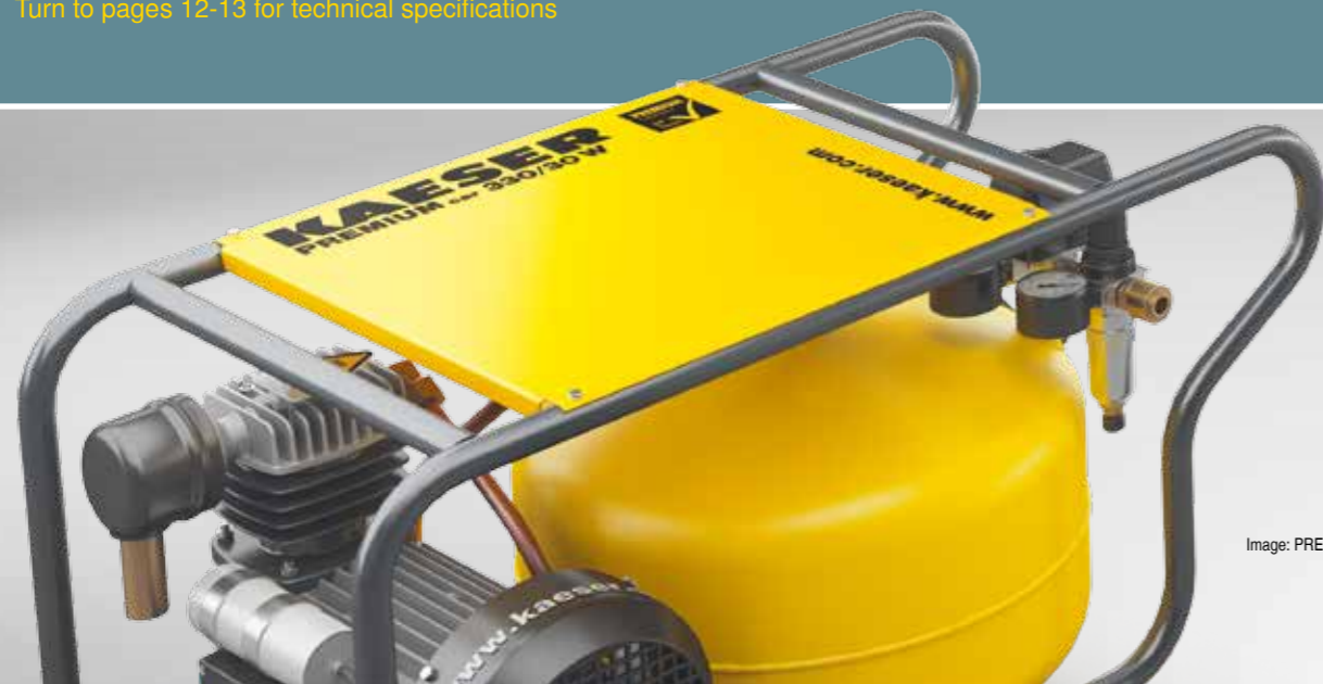
Image: PREMIUM CAR 330/30 W