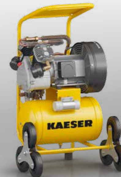
Image: PREMIUM COMPACT 450/30W