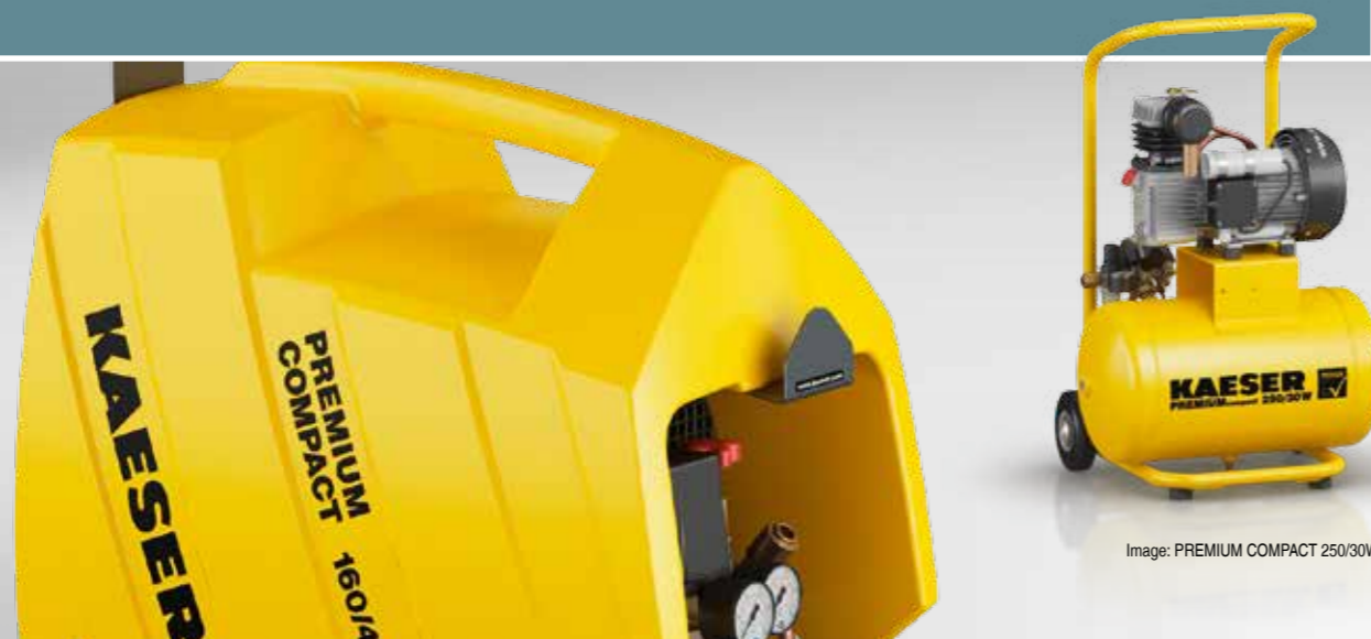
Image: PREMIUM COMPACT 250/30W