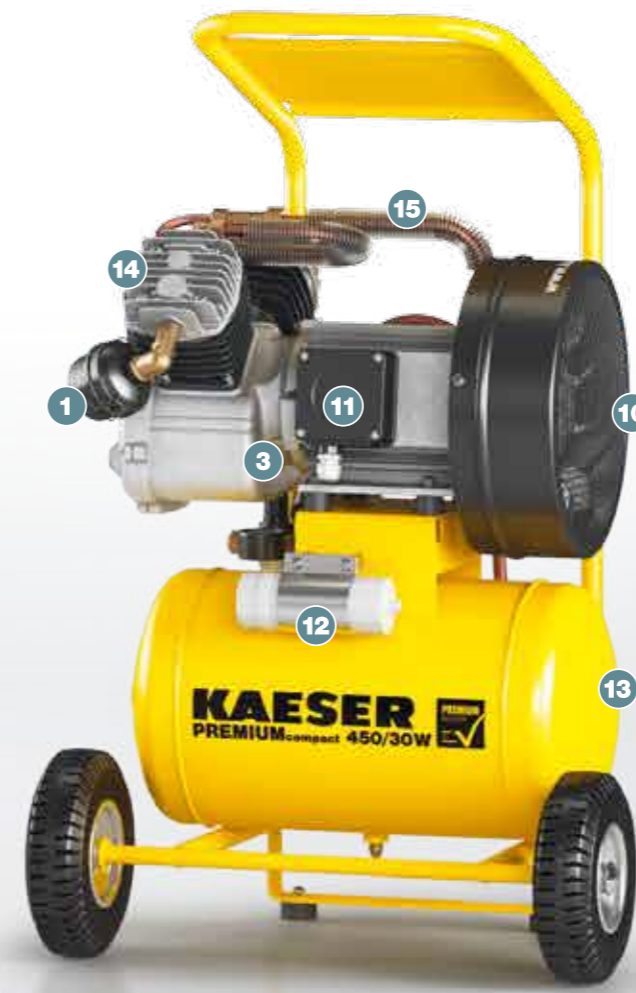
Image: PREMIUM COMPACT 450/30 W