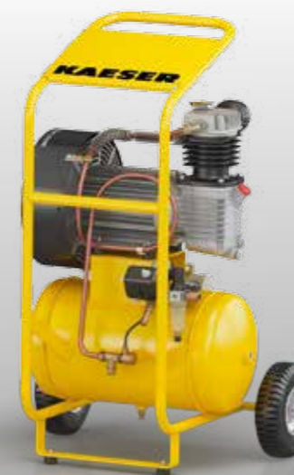
Image: PREMIUM COMPACT 350/30W

Turn to pages 12-13 for technical specifications