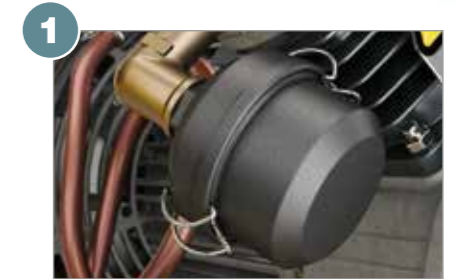
1 Silenced air intake filter