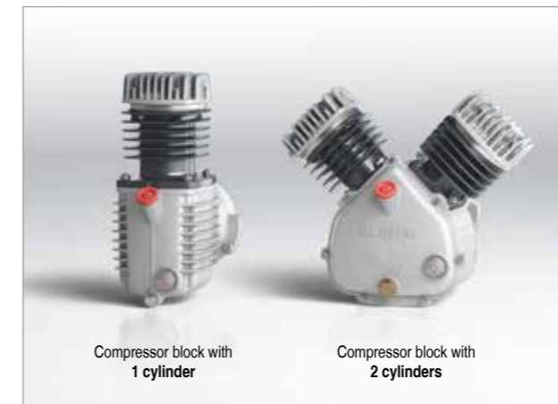
Compressor block with 1 cylinder