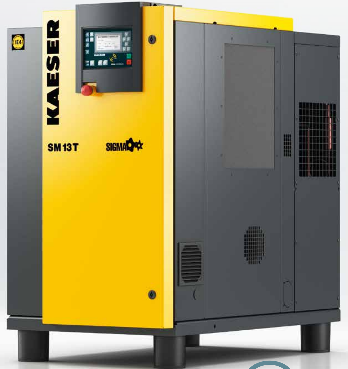
Image: SM 13 T

All maintenance work can be carried out from one side of the unit. The left housing cover is easily removed to allow excellent component accessibility.