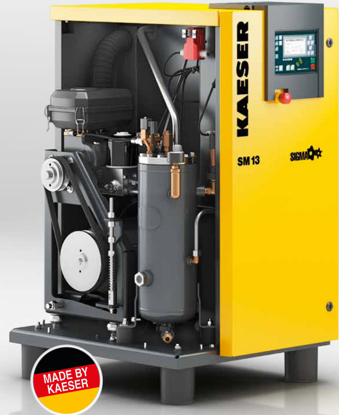
Image: SM 13