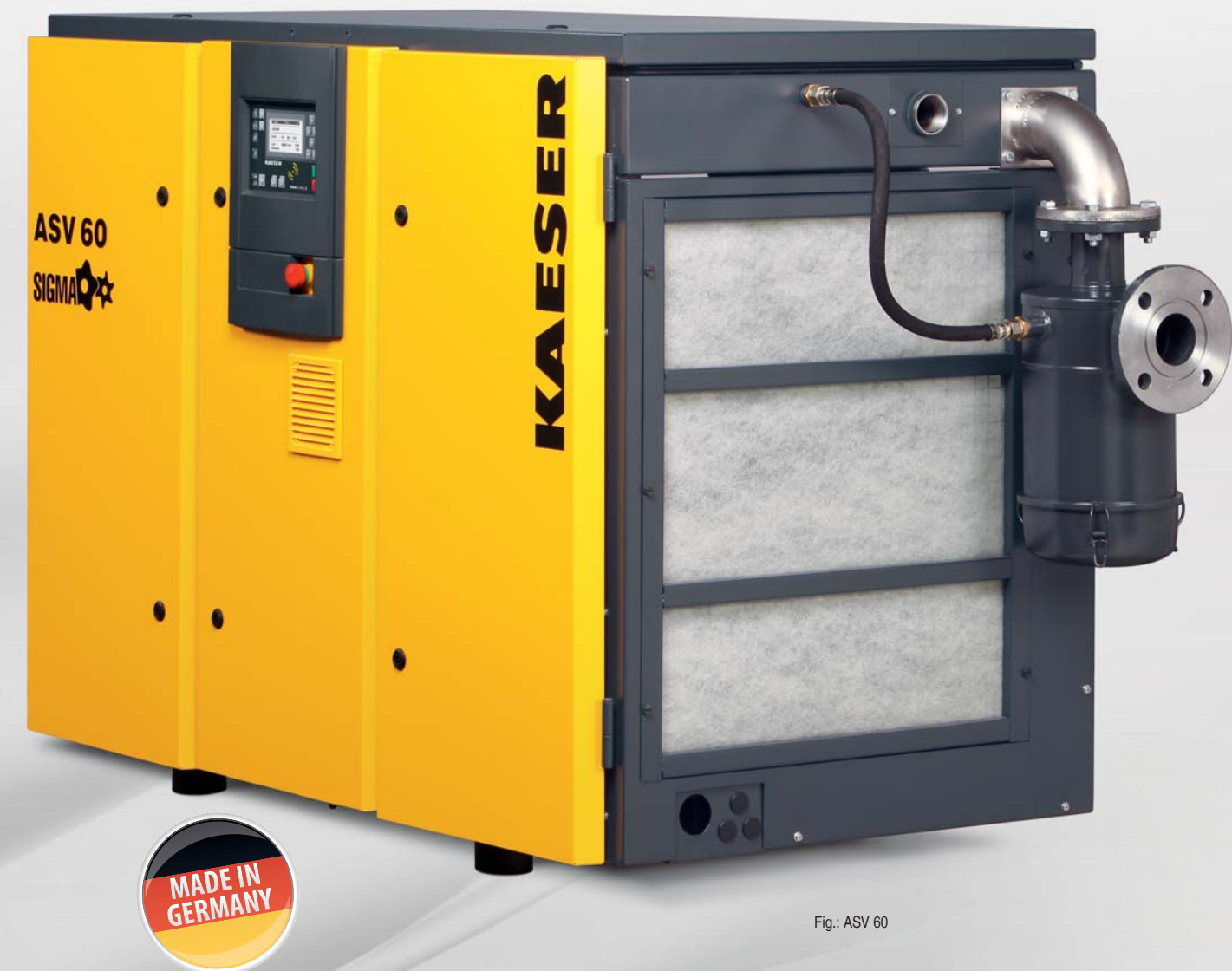
Fig.: ASV 60